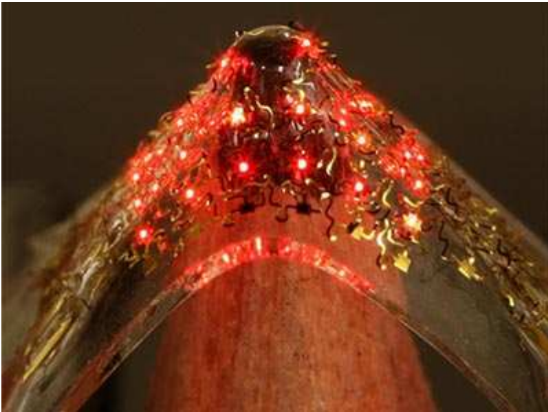
Pencil pushing LEDs

While light-emitting organic materials could have substantially simplified the process of making LEDs on a flexible substrate, organics have other shortcomings "Their brightness can't compete with inorganic LEDs, and encapsulating them to prevent exposure to minute levels of moisture and oxygen is extremely difficult," explains Rogers.