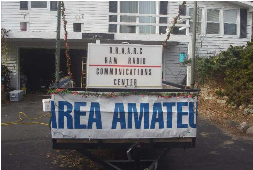
Float nearly ready for the big parade.