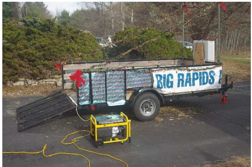
New Club generator being tested with lights connected.