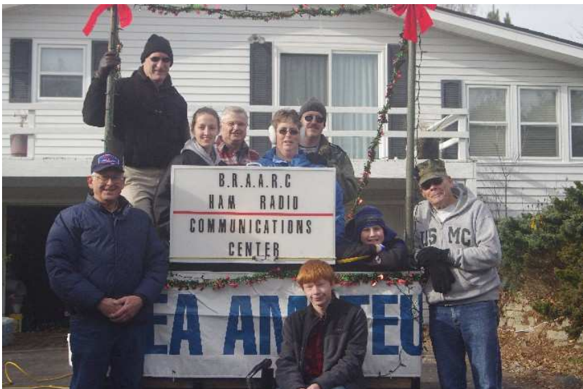
The float crew that enjoyed the mornings work along with coffee and donuts. Note that it is a bit cool.